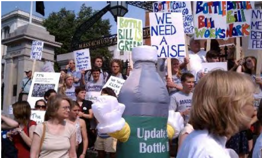
“Bottle Bill” leads the rally for the update.